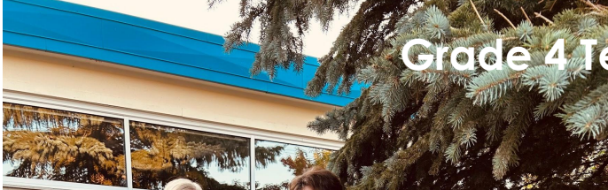
Grade 4 Team