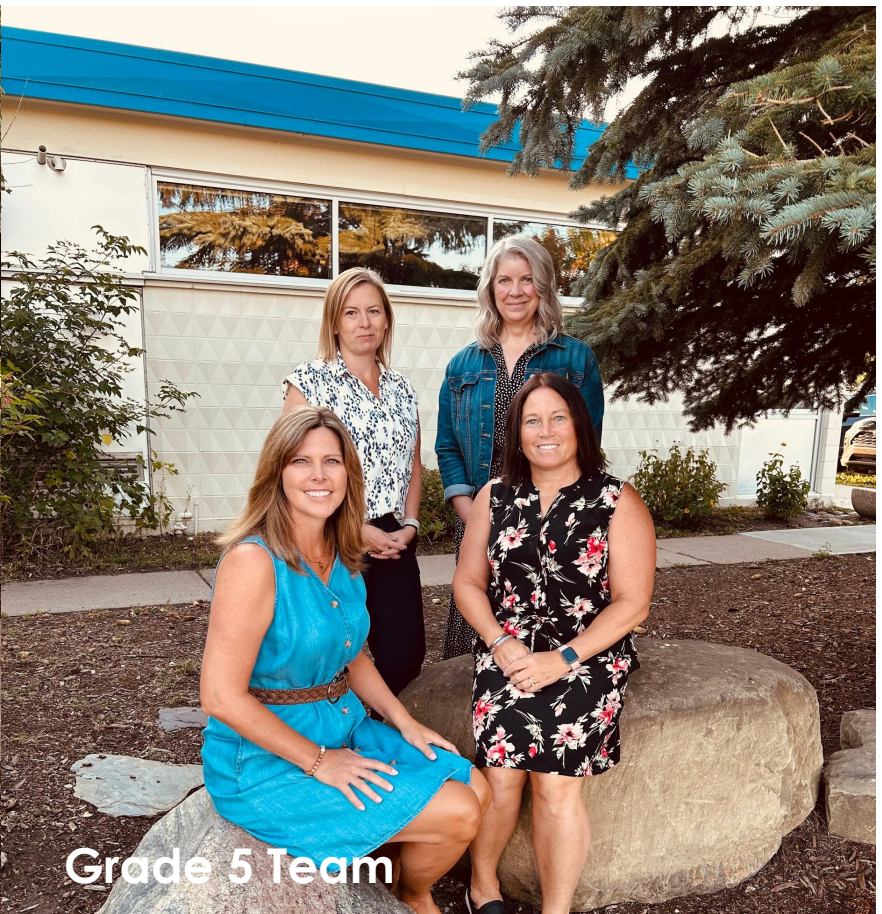
Grade 5 Team