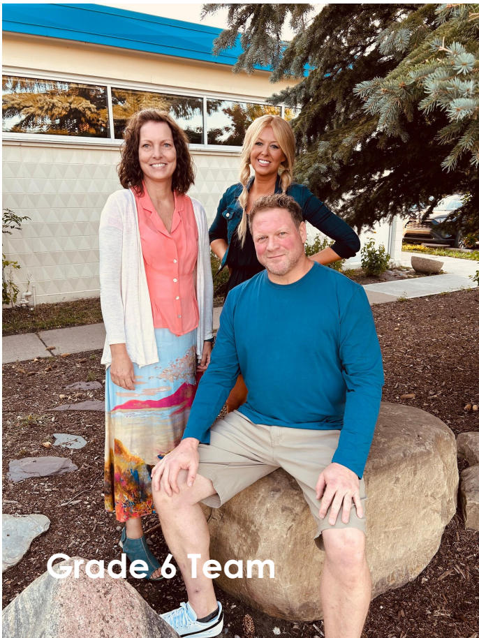
Grade 6 Team