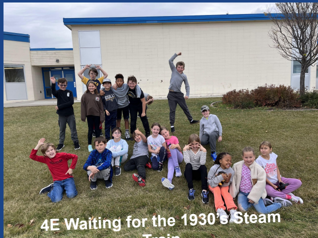
4E Waiting for the 1930's Steam Train