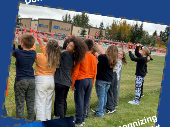
Recognizing Orange Shirt Day