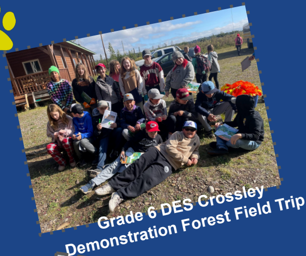
Grade 6 DES Crossley Demonstration Forest Field Trip