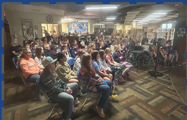
Author visit at the Penhold Public Library